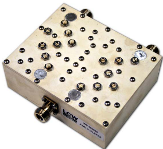
Part Number: WP-100069

LCW's WP-100069 Advanced Wireless Services Duplexer is normally available from stock. The availability of this duplexer will support the rapid deployment requirements carriers' demand.